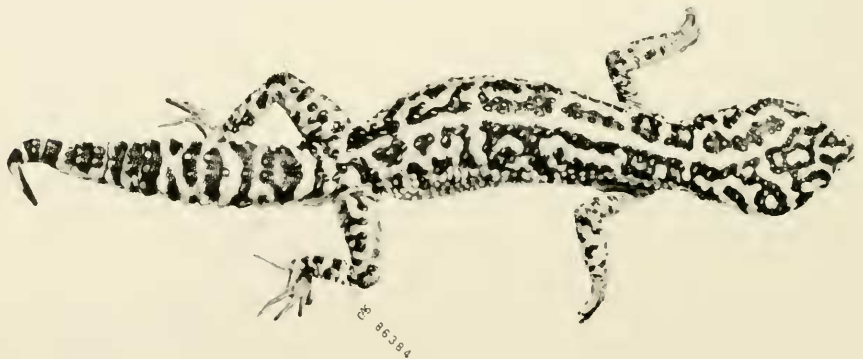
Figure 1. Dorsal view of holotype (CAS 86384) of Eublepharis angamainyu .

DESCRIPTION OF HOLOTYPE. Head depressed, massive in postorbital region owing to powerful jaw musculature, nearly cordiform; body and tail somewhat depressed. Rostral hexagonal, 1\frac{1}{2} times broader than high, a median cleft in the upper \frac{1}{3} ; nostral pierced entirely within a diagonally elongate nasal shield; supernasals separated by a single, subpentagonal internasal which is nearly twice as broad as long; nasal bordered by the rostral, supranasal, first supralabial, and 5-7 slightly enlarged scales; scales of snout enlarged, convex, some of them subconical; head covered above by unequal, small convex, polygonal, juxtaposed scales, and numerous enlarged subconical tubercles, becoming larger on posterior region of head; ten supralabials, the first highest, tenth smallest; ear opening large, 2\frac{1}{2} times higher than long, as large as eye opening; eyelids well developed, margins of lids with a row of enlarged tubercular scales; mental pentagonal, followed by four rows of ir-